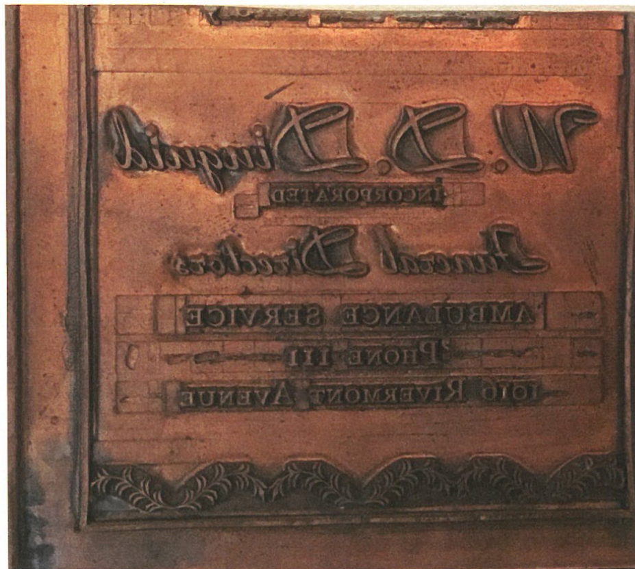
An old printing block from the time of W.D. Diuguid.

Diuguid's meticulous records for its first 150 years of service have long been available for viewing on